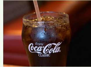
A glass of coke