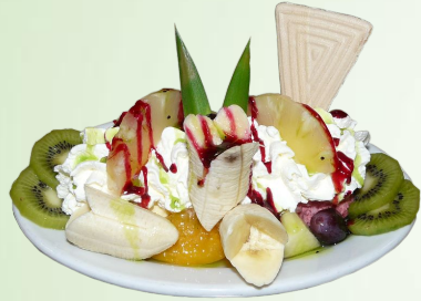
Fruit dessert Ice cream sundae